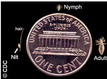
Identifying Head Lice - Head lice are small (1/8 inch or less in length) and have three distinct life stages: the egg or nit (left), the nymph (top) and the adult (right).

Head lice are bloodsucking insects that live exclusively on humans. They are usually found on the scalp, behind the ears, near the neckline at the back of the neck, and eyelashes. These parasitic insects need human blood and body warmth to survive and will die if separated from their host for only a couple of days. Head lice cannot survive for very long in rugs, carpet, or within upholstery on school buses. To feed, the louse bites through the skin and injects saliva which prevents blood from clotting; it then sucks blood into its digestive tract. Their feeding can cause intense itching and scratching of the scalp.